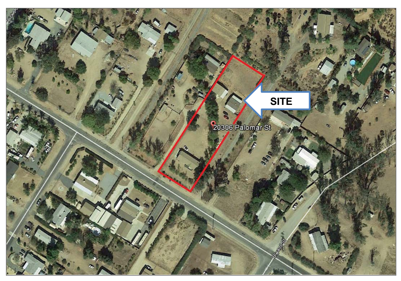
Figure 1. Vicinity/Location Map

<u>Surrounding Land Uses:</u> The project site is surrounded by residential uses to the north, east, west and south. The summary table on the following page lists the current land uses, general plan land use, and zoning designations for the site and abutting properties. Staff has also provided two exhibits (on the following pages) showing the existing general plan land use and zoning designations.