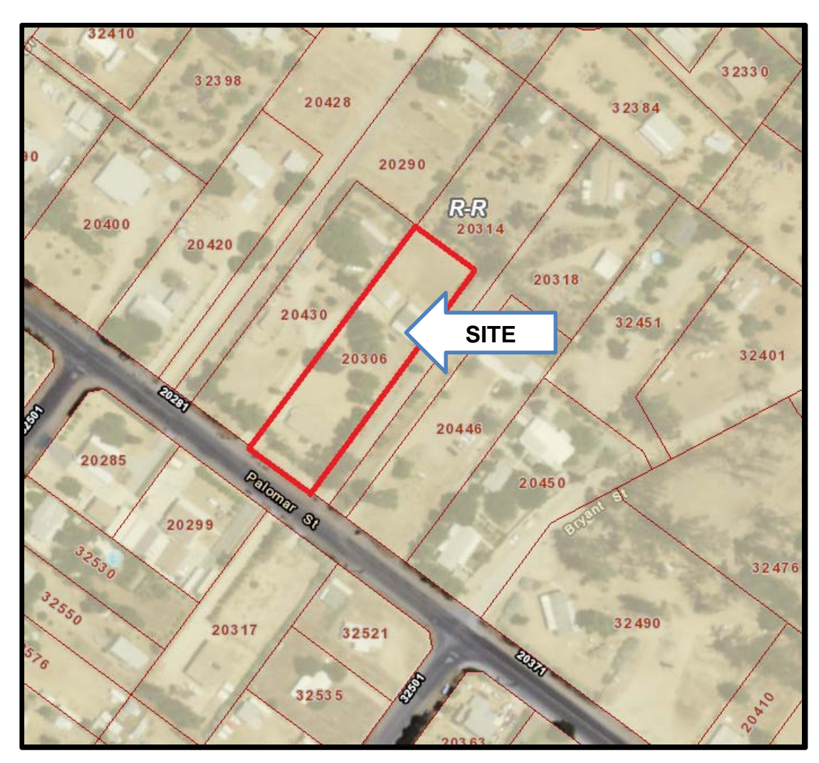
Figure 3 – Existing Zoning Designation Exhibit (R-R)