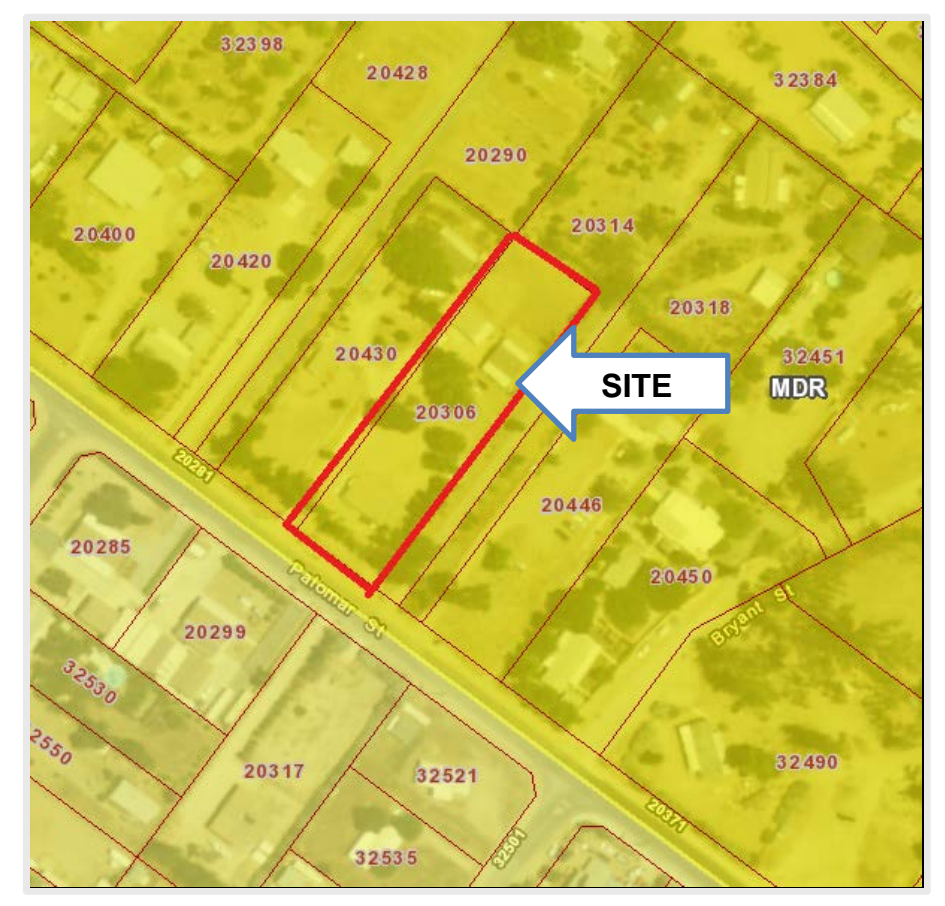
Figure 2 – Existing General Plan Land Use Exhibit (MDR)